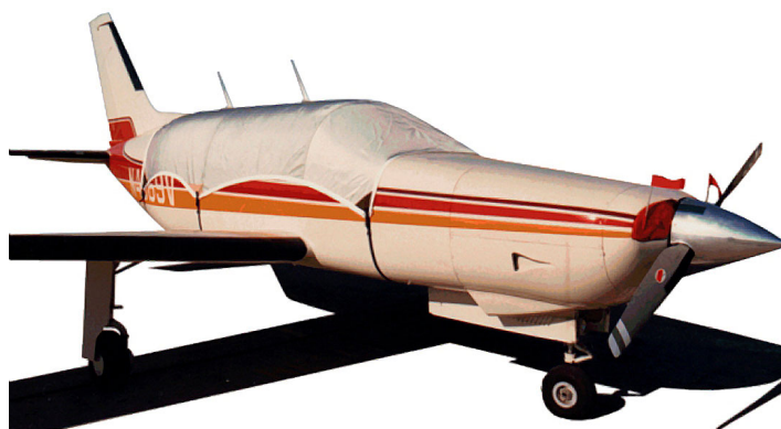
Malibu/Mirage/Meridian Standard Canopy Cover