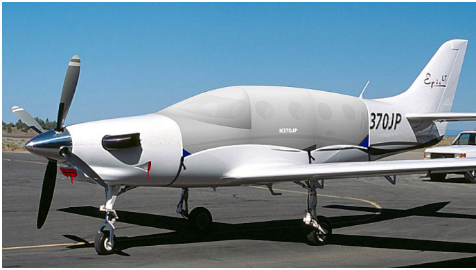
Epic LT Canopy Cover & Engine Plugs