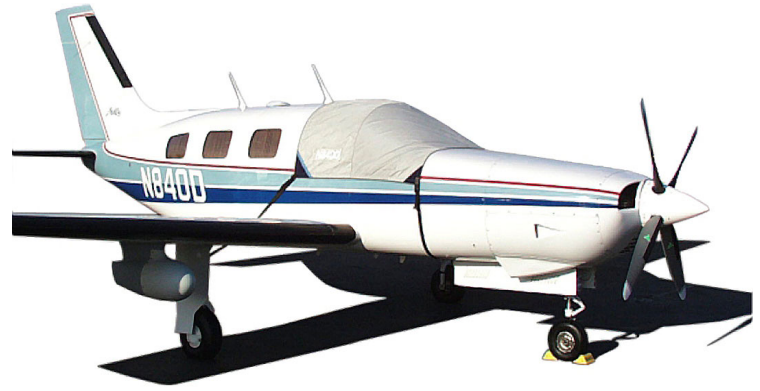
Piper Malibu/Mirage Windshield Cover