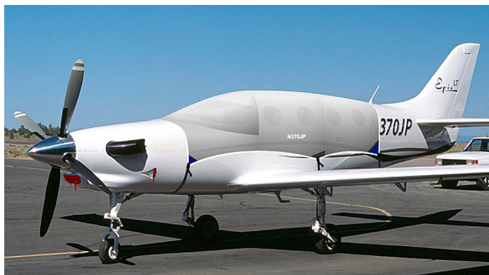
Epic LT Canopy Cover & Engine Plugs

This cover type is made from Silver Acrylic Sunbrella canvas and is 100% lined with a soft and smooth microfiber. Bruce's Custom Covers developed this material combination especially for aircraft protection. The outer material is medium weight and treated for water resistance, UV resistance and anti-static buildup. The inner lining is a very soft and smooth microfiber to prevent scratching. The material is very reflective, and tests show that the cabin interior temperature can be reduced to near-ambient temperature on the hottest of days. It is water, ice and snow repellent, yet breathable to allow moisture to escape from between the cover and the aircraft surface.