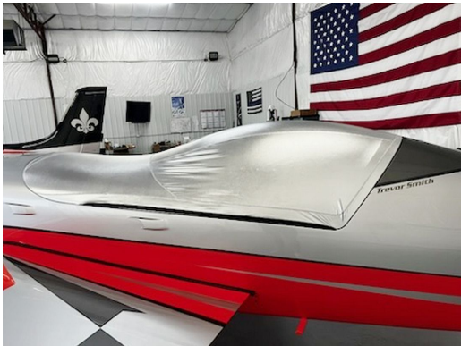
Extra NG Models Canopy Cover (SOLAR CAP EXAMPLE)

Travel Covers are made with Silver Solution-Dyed Polyester fabric and only lined over the windshield to save weight. The material is lightweight and more compact for easy stowage in the aircraft. The polyester material is water resistant, but only intended for occasional use outside. We also have an ultra lightweight material available for fitted hangar dust covers. For daily outdoor use, the non-travel Sunbrella Cover is the best choice.