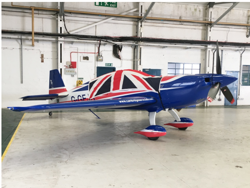
Extra 330 Canopy Cover, custom design

This cover type is made from Silver Acrylic Sunbrella canvas and is 100% lined with a soft and smooth microfiber. Bruce's Custom Covers developed this material combination especially for aircraft protection. The outer material is medium weight and treated for water resistance, UV resistance and anti-static buildup. The inner lining is a very soft and smooth microfiber to prevent scratching. The material is very reflective, and tests show that the cabin interior temperature can be reduced to near-ambient temperature on the hottest of days. It is water, ice and snow repellent, yet breathable to allow moisture to escape from between the cover and the aircraft surface.