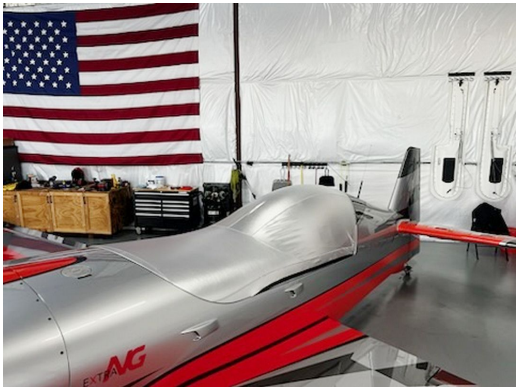
Extra NG Models Canopy Cover