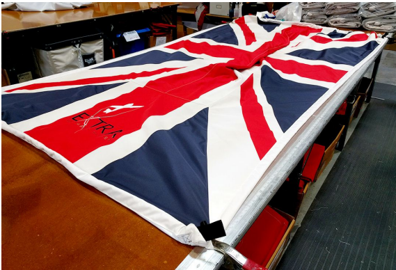
Custom Full-Cover Artwork

This cover type is made from Silver Acrylic Sunbrella canvas and is 100% lined with a soft and smooth microfiber. Bruce's Custom Covers developed this material combination especially for aircraft protection. The outer material is medium weight and treated for water resistance, UV resistance and anti-static buildup. The inner lining is a very soft and smooth microfiber to prevent scratching. The material is very reflective, and tests show that the cabin interior temperature can be reduced to near-ambient temperature on the hottest of days. It is water, ice and snow repellent, yet breathable to allow moisture to escape from between the cover and the aircraft surface.