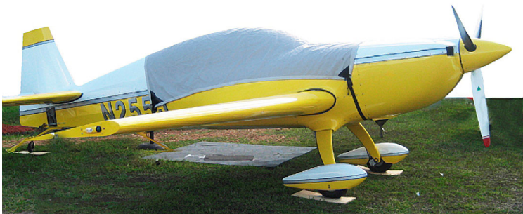
Xtremair Canopy Cover