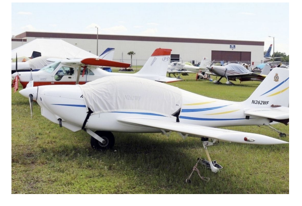
Europa Canopy Cover

The Europa All Europa Models Canopy/Engine Cover is a one-piece cover (100% lined with microfiber) that is a combination of the Canopy Cover and Engine Cover. This cover will enclose the engine cowl and will extend aft to cover all of the windows. This cover type is made from Silver Acrylic Sunbrella canvas and is 100% lined with a soft and smooth microfiber. Bruce's Custom Covers developed this material combination especially for aircraft protection. The outer material is medium weight and treated for water resistance, UV resistance and anti-static buildup. The inner lining is a very soft and smooth microfiber to prevent scratching. The material is very reflective, and tests show that the cabin interior temperature can be reduced to near-ambient temperature on the hottest of days. It is water, ice and snow repellent, yet breathable to allow moisture to escape from between the cover and the aircraft surface.