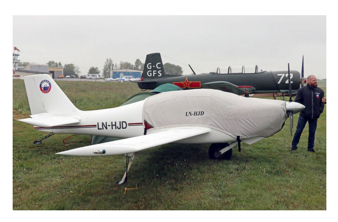
Europa Canopy/Engine Cover