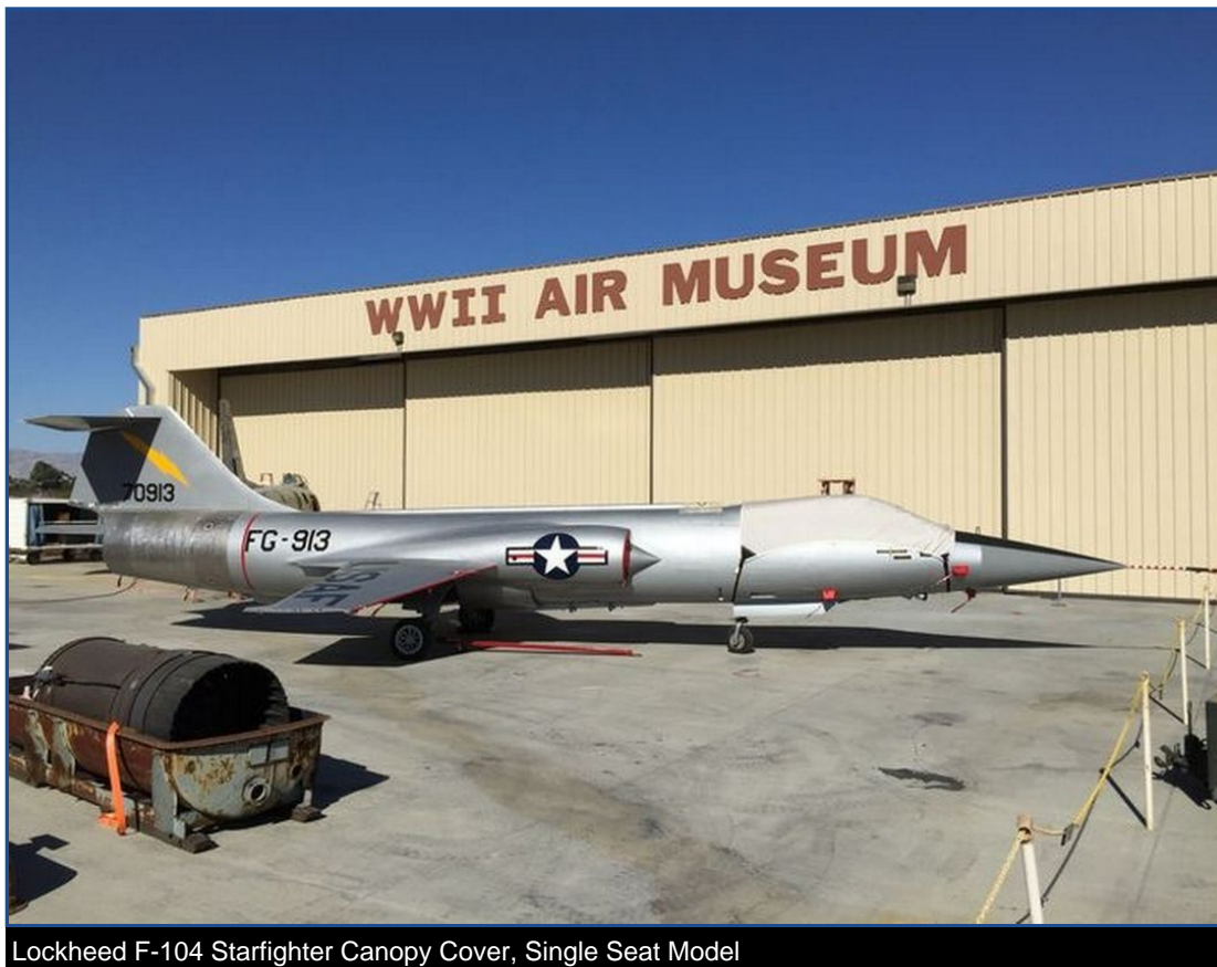
Lockheed F-104 Starfighter Canopy Cover, Single Seat Model