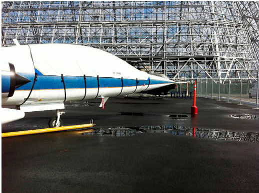
F-104 Tandem Canopy Cover