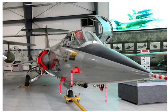
Lockheed F-104 Starfighter Intake Plugs