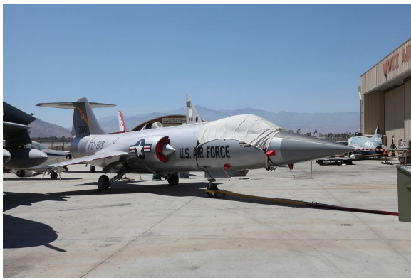
Lockheed F104 Canopy Cover, Intake Plugs