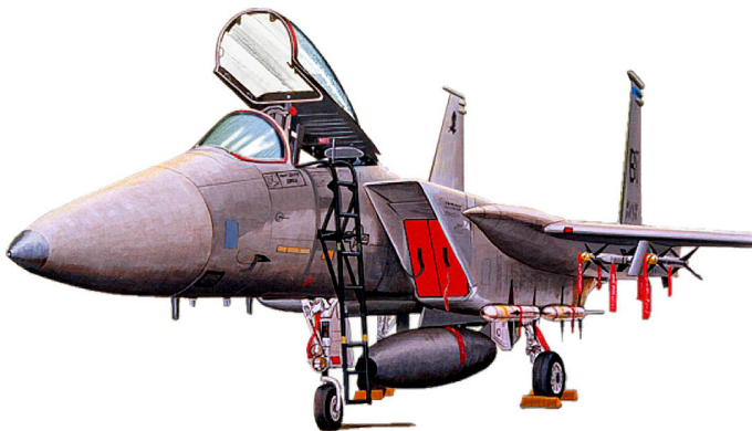
F15 Cockpit HeatShields & Intake Plugs

The Engine Inlet Plugs are custom fit for your McDonnell Douglas F-15 Eagle intakes, made with heavy-duty vinyl material, and stuffed with a single block of sculpted urethane foam. Each plug has a zipper that allows the foam to be removed and dried if necessary. Engine plugs have 'remove before flight' streamers sewn onto the face of the plugs. Most plugs are imprinted with the aircraft registration number in black for an extra charge. Storage bag NOT included. Engine plugs may be inserted after flight when the engine is still warm. Engine Inlet Plugs are commonly referred to as Cowl Plugs, Intake Plugs, Cowl Blocks, Engine Blocks, and Engine Bungs.