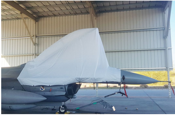
McDonnell Douglas F16-D Canopy Cover, open cockpit type (test fit cover)

Canopy Covers are commonly referred to as Cabin Covers, Fuselage Covers, Canvas Covers, Canopy Caps, etc.