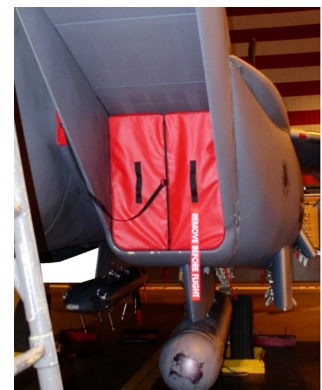
F15 Intake Plugs