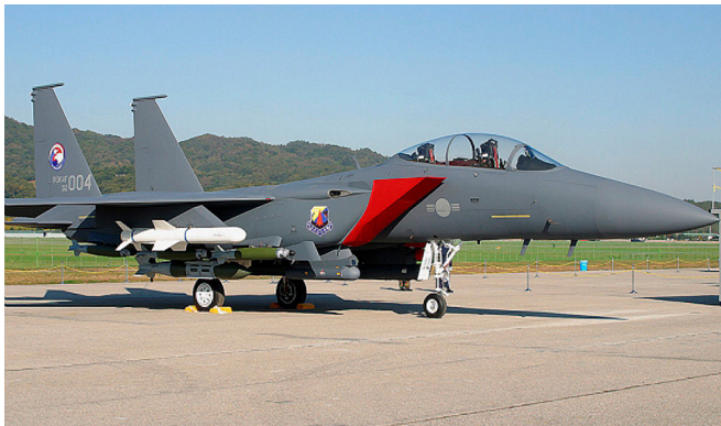
Intake Cover, F15-K

The McDonnell Douglas F-15 Eagle Intake Covers are designed to install easily yet be completely storable. A spring steel hoop is sewn into the hem of each cover, allowing them to be installed without climbing onto the wing or using a stepladder. To store the covers the spring steel hoop folds like a band-saw blade into three nesting rings. Each cover folds into a compact circular bundle which is stored in the included duffle bag, yet they unfold quickly for use. The Tri-Fold Ring cover is made of medium weight nylon which is available in a variety of colors to match the paint trim. Each cover set comes complete with installation and folding instructions. The aircraft's registration number can be silkscreened onto the cover for an extra charge.