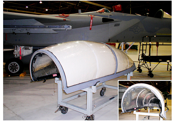
F-15 Cockpit HeatShield