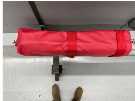
McDonnell Douglas F-15 Launcher Rail Cover