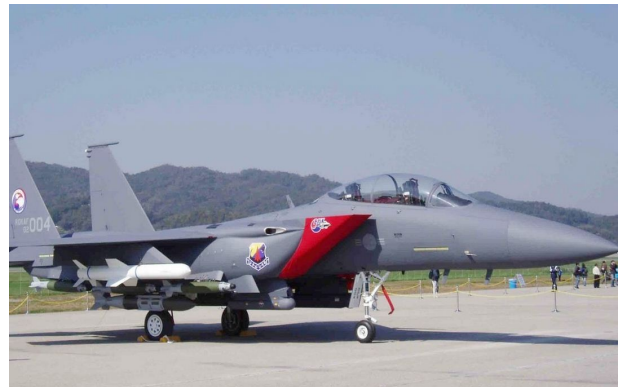
McDonnell Douglas F-15 Eagle Engine Inlet Covers