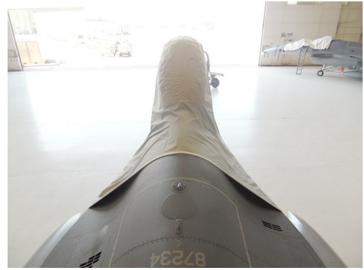
F-16 CANOPY COVER, OPEN POSITION (C-Model, single seat models)