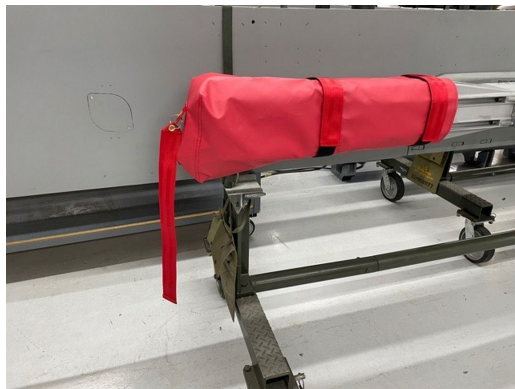
McDonnell Douglas F-15 Launcher Rail Cover

ALL-YEAR USE MATERIAL - Made with Silver Acrylic Sunbrella canvas, the all-year use material is the best option for sun protection and cover longevity. This heavier more durable material is intended for all weather conditions, such as rain and snow or lots of sun.