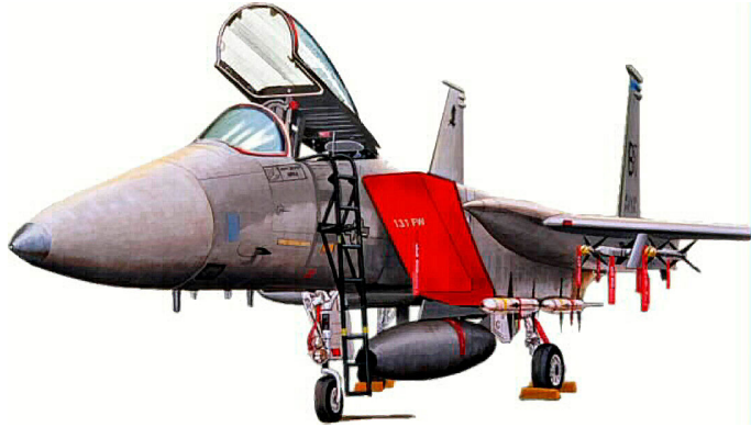
F15 Cockpit HeatShields & Inlet Cover

Heatshields are interior sunshades for an aircraft's windows or canopy glass. The product is a unique composite of closed-cell foam with a silver mylar finish. The semi-rigid design is stiff enough to stand along the inside of the windshield using sun visors or window framing. It folds up flat and easily stores in the included storage sleeve. Some designs may require velcro and suction cups. A Heatshield is an excellent short-term remedy for cockpit overheating.