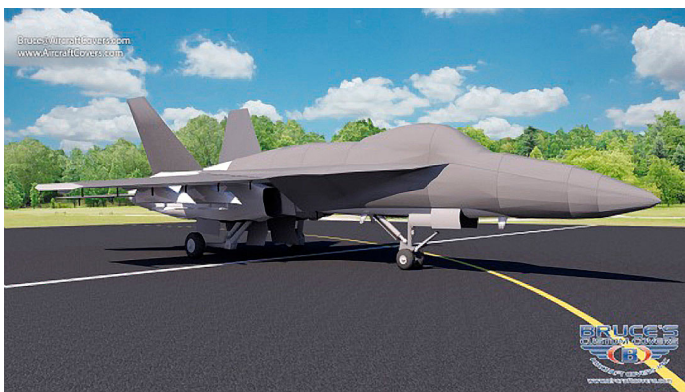
F-18 Storage Covers, 3D rendering