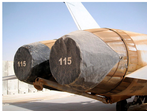
F-18 Exhaust Covers