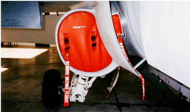
Engine & ECS Inlet Plugs

The Engine Inlet Plugs are custom fit for your McDonnell Douglas F-18 Hornet, Super Hornet intakes, made with heavy-duty vinyl material, and stuffed with a single block of sculpted urethane foam. Each plug has a zipper that allows the foam to be removed and dried if necessary. Engine plugs have 'remove before flight' streamers sewn onto the face of the plugs. Most plugs are imprinted with the aircraft registration number in black for an extra charge. Storage bag NOT included. Engine plugs may be inserted after flight when the engine is still warm. Engine Inlet Plugs are commonly referred to as Cowl Plugs, Intake Plugs, Cowl Blocks, Engine Blocks, and Engine Bungs.