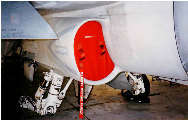
Engine Inlet Plug