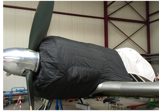
Focke Wulf 190 Canopy Cover & Insulated Engine Cover