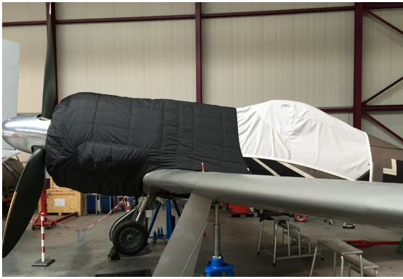
Focke Wulf 190 Canopy Cover & Insulated Engine Cover