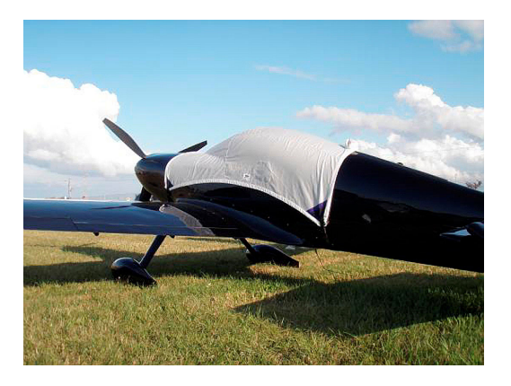
Harmon Rocket Canopy Cover