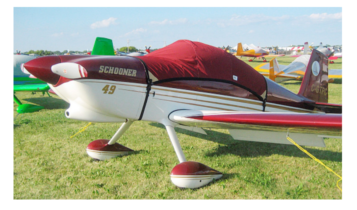
F1 Rocket Canopy Cover

This cover type is made from Silver Acrylic Sunbrella canvas and is 100% lined with a soft and smooth microfiber. Bruce's Custom Covers developed this material combination especially for aircraft protection. The outer material is medium weight and treated for water resistance, UV resistance and anti-static buildup. The inner lining is a very soft and smooth microfiber to prevent scratching. The material is very reflective, and tests show that the cabin interior temperature can be reduced to near-ambient temperature on the hottest of days. It is water, ice and snow repellent, yet breathable to allow moisture to escape from between the cover and the aircraft surface.