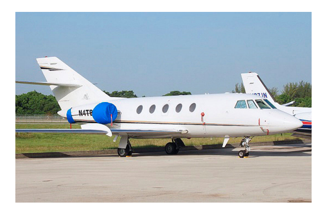
Falcon Engine Cover & Cockpit HeatShields

The Falcon Jet 200 (20H) Intake Covers are designed to install easily yet be completely storable. A spring steel hoop is sewn into the hem of each cover, allowing them to be installed without climbing onto the wing or using a stepladder. To store the covers the spring steel hoop folds like a band-saw blade into three nesting rings. Each cover folds into a compact circular bundle which is stored in the included duffle bag, yet they unfold quickly for use. The Tri-Fold Ring cover is made of medium weight nylon which is available in a variety of colors to match the paint trim. Each cover set comes complete with installation and folding instructions. The aircraft's registration number can be silkscreened onto the cover for an extra charge.