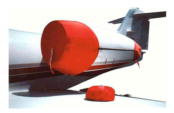
Lear 30 Tri-Fold Engine Cover