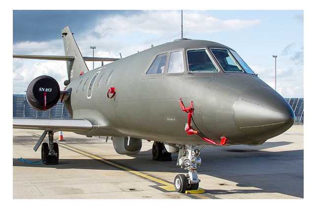
Falcon Engine Covers (not our probe covers)

The Engine Inlet Plugs are custom fit for your Falcon Jet 200 (20H) intakes, made with heavy-duty vinyl material, and stuffed with a single block of sculpted urethane foam. Each plug has a zipper that allows the foam to be removed and dried if necessary. Engine plugs have 'remove before flight' streamers sewn onto the face of the plugs. Most plugs are imprinted with the aircraft registration number in black for an extra charge. Storage bag NOT included. Engine plugs may be inserted after flight when the engine is still warm. Engine Inlet Plugs are commonly referred to as Cowl Plugs, Intake Plugs, Cowl Blocks, Engine Blocks, and Engine Bungs.