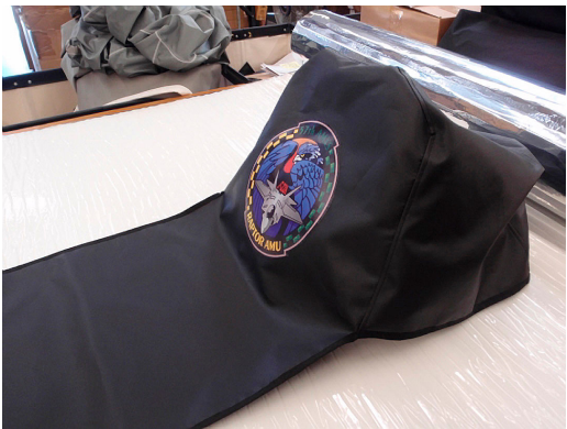
F22 Raptor Ejection Seat Maintenance Cover