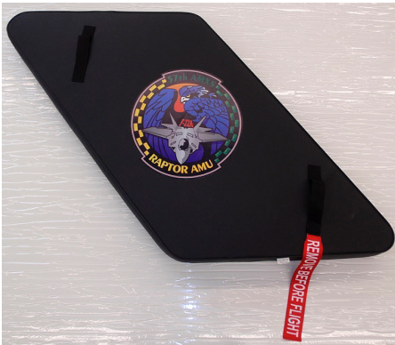
F-22 Raptor Engine Inlet Plug

The Engine Inlet Plugs are custom fit for your Lockheed Martin/Boeing F-22 Raptor intakes, made with heavy-duty vinyl material, and stuffed with a single block of sculpted urethane foam. Each plug has a zipper that allows the foam to be removed and dried if necessary. Engine plugs have 'remove before flight' streamers sewn onto the face of the plugs. Most plugs are imprinted with the aircraft registration number in black for an extra charge. Storage bag NOT included. Engine plugs may be inserted after flight when the engine is still warm. Engine Inlet Plugs are commonly referred to as Cowl Plugs, Intake Plugs, Cowl Blocks, Engine Blocks, and Engine Bungs.