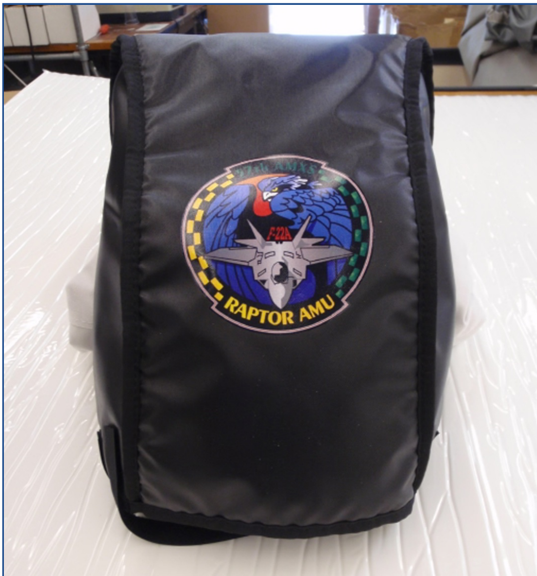
F-22 Raptor HUD Cover, padded