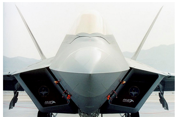
F-22 Raptor Engine Inlet Plugs Set