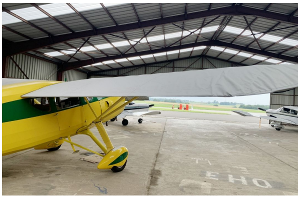
Fairchild 24 Wing Covers