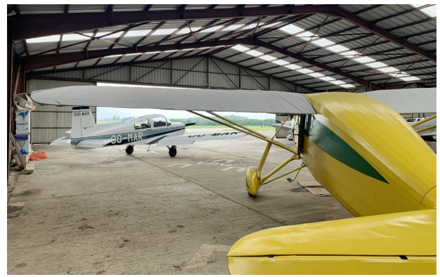
Fairchild 24 Wing Covers