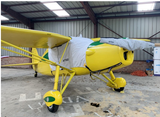
Fairchild 24 Over-Top Canopy Cover