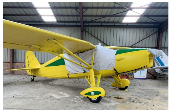
Fairchild 24 Over-Top Canopy Cover, Prop Cover