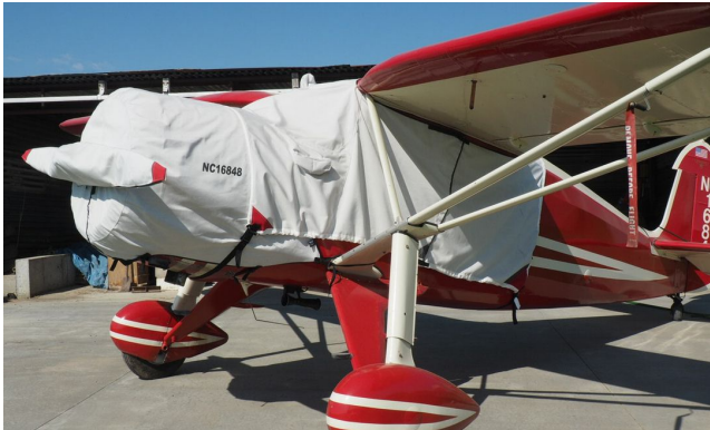
Fairchild 24W Canopy, Engine & Prop Cover