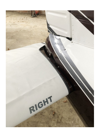
Piper PA-28 Horizontal Stabilizer Cover