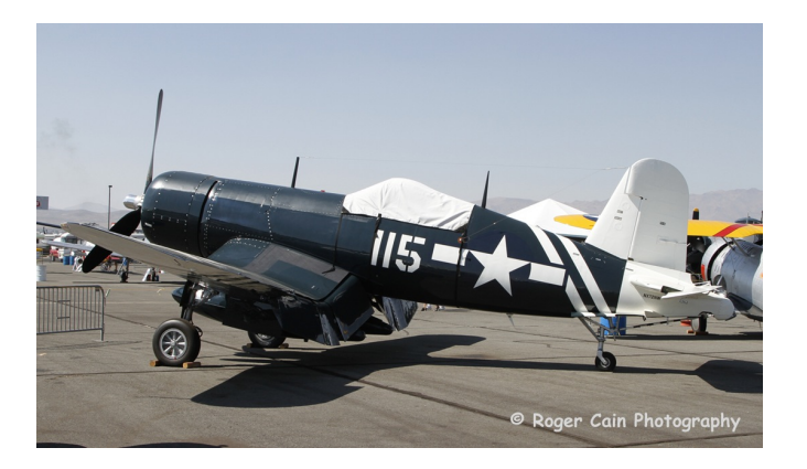
Chance Vought F4U Corsair