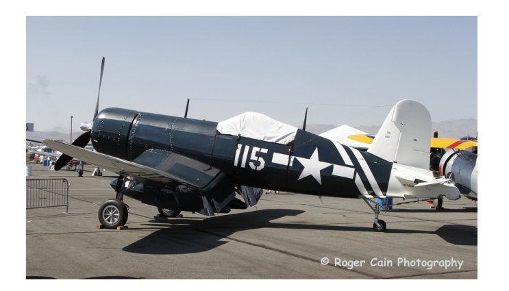
Chance Vought F4U Corsair