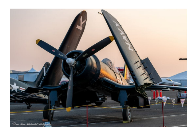
Chance Vought F4U Canopy Cover