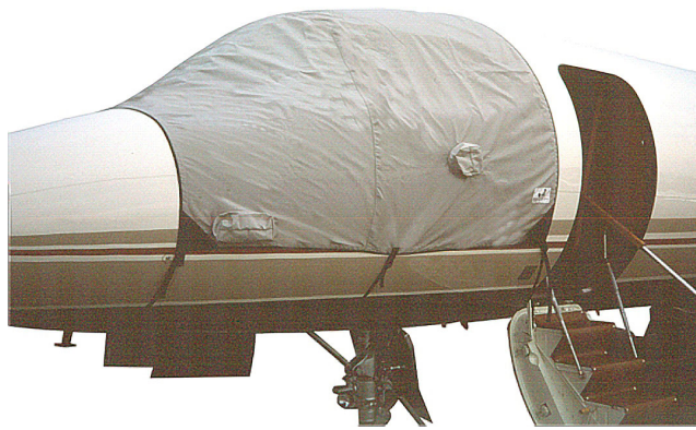
Falcon 50 Windshield Cover