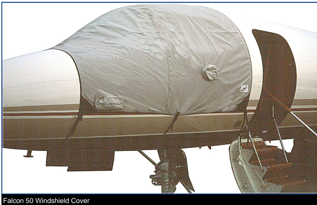
Falcon 50 Windshield Cover