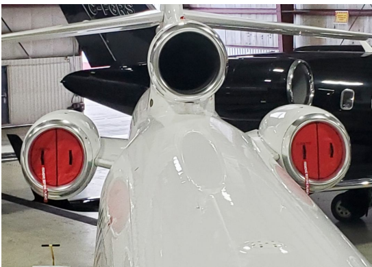
Falcon F7X Outboard Intake Plugs

The Engine Inlet Plugs are custom fit for your Falcon Jet 7X intakes, made with heavy-duty vinyl material, and stuffed with a single block of sculpted urethane foam. Each plug has a zipper that allows the foam to be removed and dried if necessary. Engine plugs have 'remove before flight' streamers sewn onto the face of the plugs. Most plugs are imprinted with the aircraft registration number in black for an extra charge. Storage bag NOT included. Engine plugs may be inserted after flight when the engine is still warm. Engine Inlet Plugs are commonly referred to as Cowl Plugs, Intake Plugs, Cowl Blocks, Engine Blocks, and Engine Bungs.