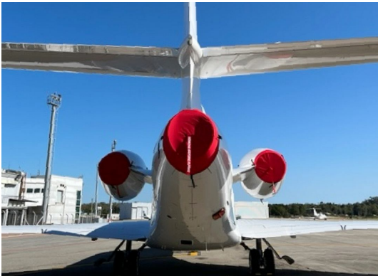
Falcon 7X Intake/Exhaust Covers

The Falcon Jet 7X Intake Covers are designed to install easily yet be completely storable. A spring steel hoop is sewn into the hem of each cover, allowing them to be installed without climbing onto the wing or using a stepladder. To store the covers the spring steel hoop folds like a band-saw blade into three nesting rings. Each cover folds into a compact circular bundle which is stored in the included duffle bag, yet they unfold quickly for use. The Tri-Fold Ring cover is made of medium weight nylon which is available in a variety of colors to match the paint trim. Each cover set comes complete with installation and folding instructions. The aircraft's registration number can be silkscreened onto the cover for an extra charge.