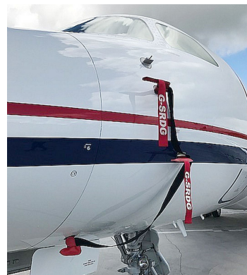
Falcon Jet 7X Pitot Probe/Aoa Set, Heat Resistant Type