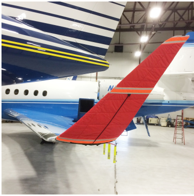
Falcon 2000 Winglet Pad