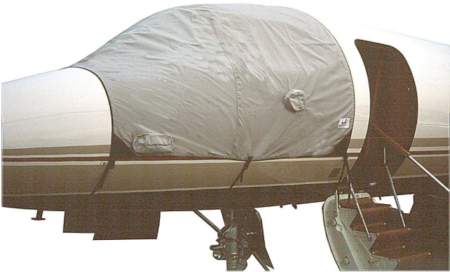
Falcon 50 Windshield Cover

This cover type is made from Silver Acrylic Sunbrella canvas and is 100% lined with a soft and smooth microfiber. Bruce's Custom Covers developed this material combination especially for aircraft protection. The outer material is medium weight and treated for water resistance, UV resistance and anti-static buildup. The inner lining is a very soft and smooth microfiber to prevent scratching. The material is very reflective, and tests show that the cabin interior temperature can be reduced to near-ambient temperature on the hottest of days. It is water, ice and snow repellent, yet breathable to allow moisture to escape from between the cover and the aircraft surface.