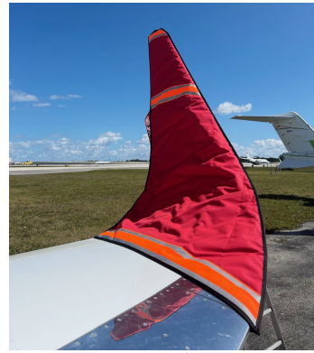
Falcon Jet 900 Winglet Padding Covers