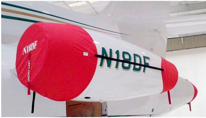
Falcon 900 Engine Cover Set