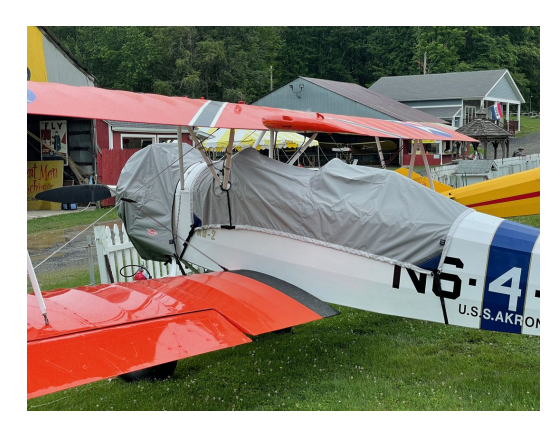
Fleet Biplane Model 1 Canopy & Engine Covers