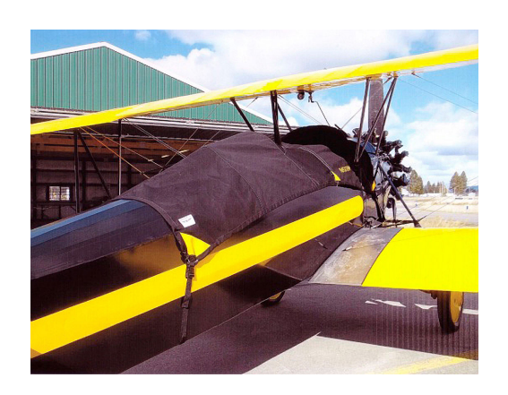
Stearman C3 Canopy Cover