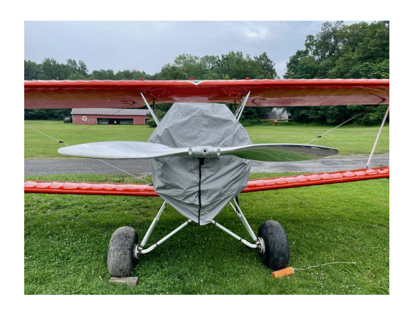
Fleet Biplane Model 1 Canopy & Engine Covers