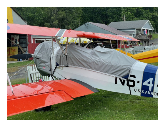
Fleet Biplane Model 1 Canopy & Engine Covers