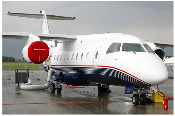
Fairchild/Dornier 328 Engine Covers