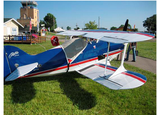
Pitts S-1 Canopy Cover