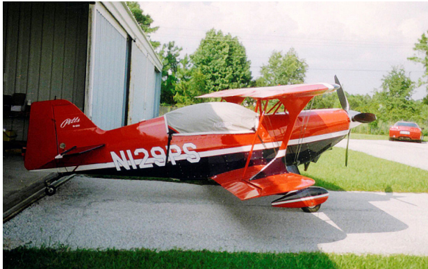
Pitts S2 Canopy Cover

This cover type is made from Silver Acrylic Sunbrella canvas and is 100% lined with a soft and smooth microfiber. Bruce's Custom Covers developed this material combination especially for aircraft protection. The outer material is medium weight and treated for water resistance, UV resistance and anti-static buildup. The inner lining is a very soft and smooth microfiber to prevent scratching. The material is very reflective, and tests show that the cabin interior temperature can be reduced to near-ambient temperature on the hottest of days. It is water, ice and snow repellent, yet breathable to allow moisture to escape from between the cover and the aircraft surface.