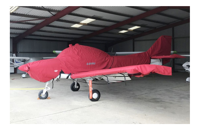
FLS Club Sprint Empennage Cover (Tailboom, Vertical & Horiz Stabilizers) All Year Use