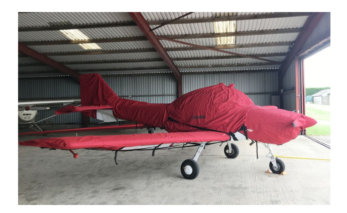
FLS Club Sprint Empennage Cover (Tailboom, Vertical & Horiz Stabilizers) All Year Use