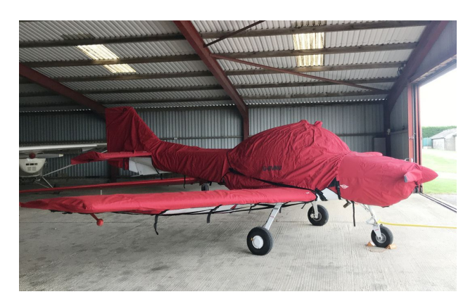
FLS Club Sprint Extended Canopy Cover

WINTER USE MATERIAL - Made with Solution-Dyed Polyester fabric, this option is intended for seasonal use to aid in deicing, rain mitigation, or for occasional travel. The material is lighter and more compact, but more susceptible to UV damage and may have a shorter useful life if used continuously outside than the all-year use material.