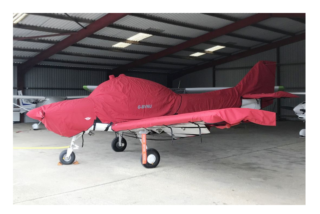
FLS Club Sprint Engine Cover