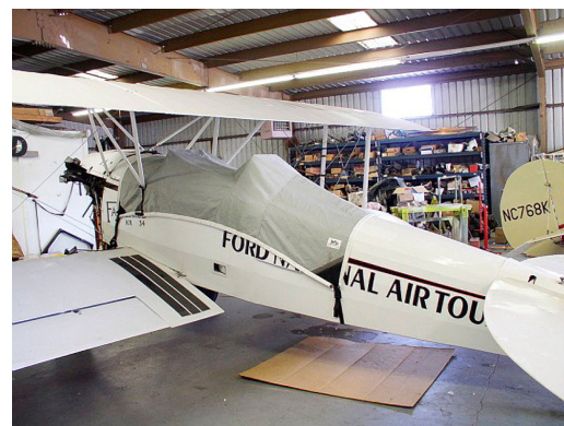
Fairchild KR-34 Canopy Cover