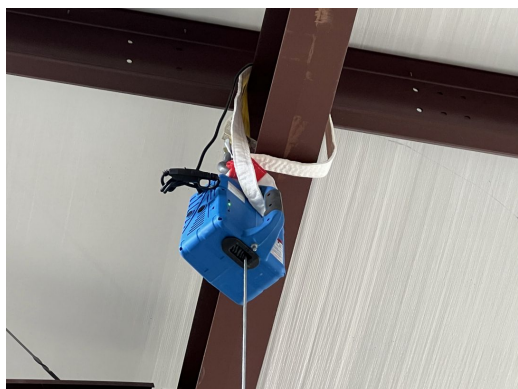
Stearman PT-13 Full Body Dust Cover, Remote Control Winch

Some high value aircraft end up logging lots of hangar time, and become dust magnets in the process. A high quality, well fitting dust cover provides easy assurance that the aircraft's surfaces remain clean and free of grit and grime. Available in a large variety of colors, each dust cover is custom made according to aircraft details and customer preferences. Fire retardant fabrics are also available.