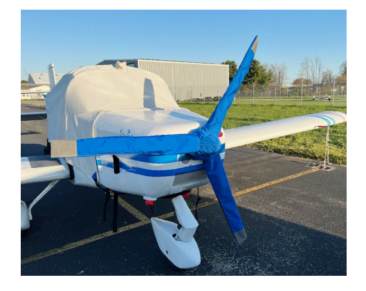
S C Aerostar Festival Prop Cover, Extended Canopy Cover

This cover type is made from Silver Acrylic Sunbrella canvas and is 100% lined with a soft and smooth microfiber. Bruce's Custom Covers developed this material combination especially for aircraft protection. The outer material is medium weight and treated for water resistance, UV resistance and anti-static buildup. The inner lining is a very soft and smooth microfiber to prevent scratching. The material is very reflective, and tests show that the cabin interior temperature can be reduced to near-ambient temperature on the hottest of days. It is water, ice and snow repellent, yet breathable to allow moisture to escape from between the cover and the aircraft surface.