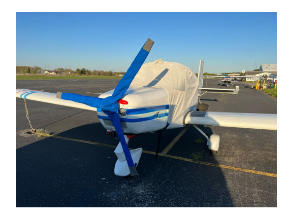
S C Aerostar Festival Prop Cover, Extended Canopy Cover