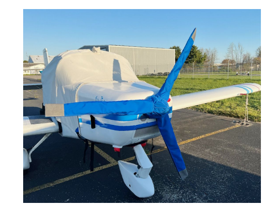
Canopy Cover, Prop Cover