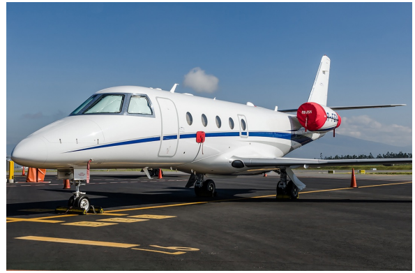
Gulfstream G150 Engine Covers, Cockpit HeatShields