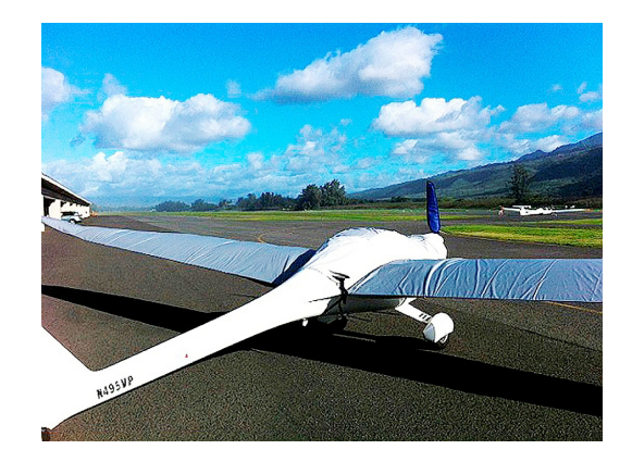
Lambada Canopy/Engine Cover and Wing Covers