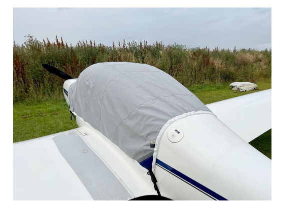
Grob 109 Travel Cover, Light Weight Canopy Cover