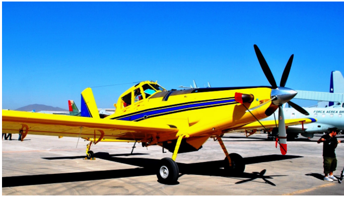
Air Tractor Prop Tie/Exhaust Covers