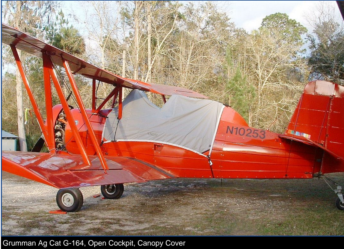
Grumman Ag Cat G-164, Open Cockpit, Canopy Cover