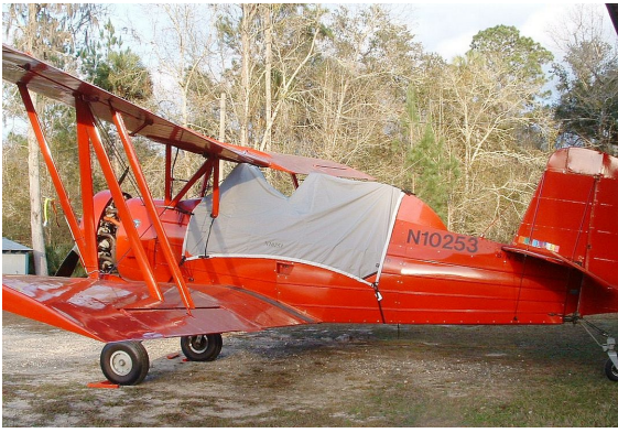
Grumman Ag Cat G-164, Open Cockpit, Canopy Cover