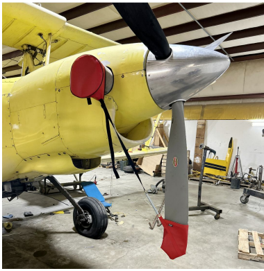
Schweizer Ag-Cat Prop Tie/Exhaust Cover Set