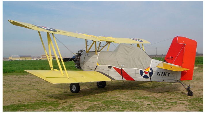
Canopy Cover for the Grumman Ag Cat