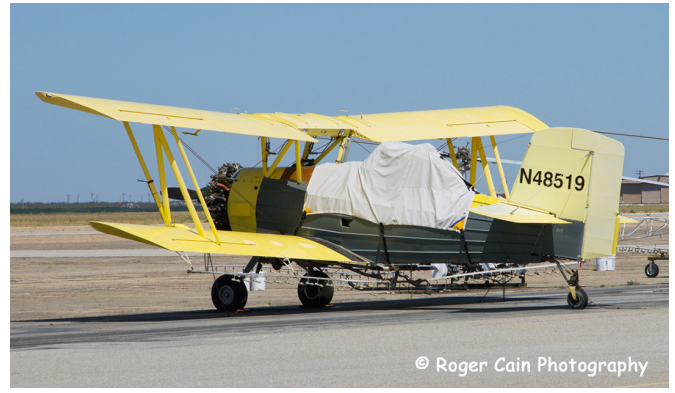
Grumman AG Cat Canopy Cover