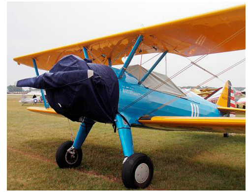
Stearman PT-13 Engine Cover