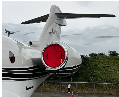
Gulfstream G280 Intake Plugs