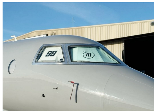
Gulfstream G200 Cockpit Heatshields