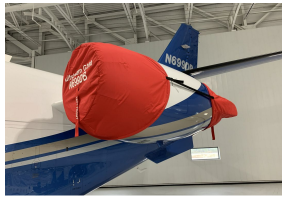
Canadair Challenger 300 Intake/Exhaust Covers, 3-Strap Type Grumman Gulfstream G200, G280 Engine Cover Set, G200 Model