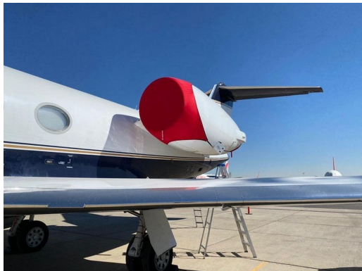
Grumman Gulfstream G-IV SP Engine Cover, bikini type

The Gulfstream Aerospace Gulfstream IV (C-20G), G350, G450 Intake Covers are designed to install easily yet be completely storable. A spring steel hoop is sewn into the hem of each cover, allowing them to be installed without climbing onto the wing or using a stepladder. To store the covers the spring steel hoop folds like a band-saw blade into three nesting rings. Each cover folds into a compact circular bundle which is stored in the included duffle bag, yet they unfold quickly for use. The Tri-Fold Ring cover is made of medium weight nylon which is available in a variety of colors to match the paint trim. Each cover set comes complete with installation and folding instructions. The aircraft's registration number can be silkscreened onto the cover for an extra charge.