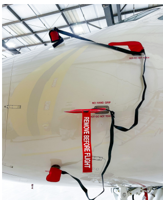
Gulfstream GVII Pitot Probes/TAT/Ice Detector Set, Heat Resistant Type

The Engine Inlet Plugs are custom fit for your Gulfstream Aerospace Gulfstream IV (C-20G), G350, G450 intakes, made with heavy-duty vinyl material, and stuffed with a single block of sculpted urethane foam. Each plug has a zipper that allows the foam to be removed and dried if necessary. Engine plugs have 'remove before flight' streamers sewn onto the face of the plugs. Most plugs are imprinted with the aircraft registration number in black for an extra charge. Storage bag NOT included. Engine plugs may be inserted after flight when the engine is still warm. Engine Inlet Plugs are commonly referred to as Cowl Plugs, Intake Plugs, Cowl Blocks, Engine Blocks, and Engine Bungs.