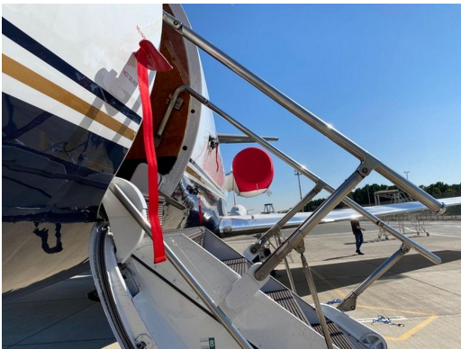
Grumman Gulfstream G-IV SP Pitot Cover

The Engine Inlet Plugs are custom fit for your Gulfstream Aerospace Gulfstream IV (C-20G), G350, G450 intakes, made with heavy-duty vinyl material, and stuffed with a single block of sculpted urethane foam. Each plug has a zipper that allows the foam to be removed and dried if necessary. Engine plugs have 'remove before flight' streamers sewn onto the face of the plugs. Most plugs are imprinted with the aircraft registration number in black for an extra charge. Storage bag NOT included. Engine plugs may be inserted after flight when the engine is still warm. Engine Inlet Plugs are commonly referred to as Cowl Plugs, Intake Plugs, Cowl Blocks, Engine Blocks, and Engine Bunges.