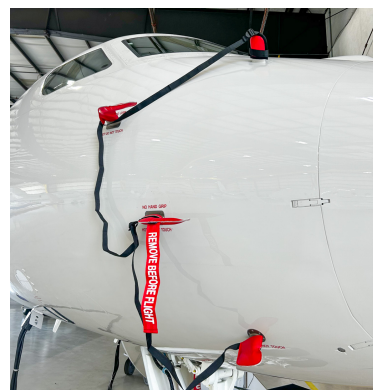
Gulfstream GVII Pitot Probes/TAT/Ice Detector Set, Heat Resistant Type