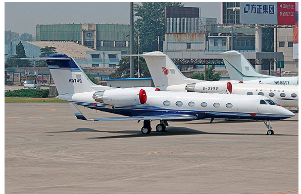
Gulfstream G-IV Intake Covers