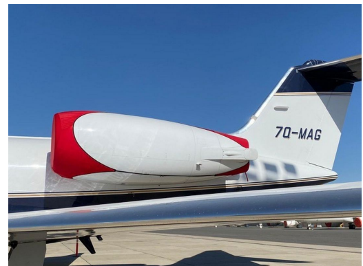
Grumman Gulfstream G-IV SP Engine Cover, bikini type