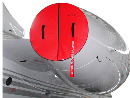
Grumman Gulfstream Exhaust Plugs, folding type