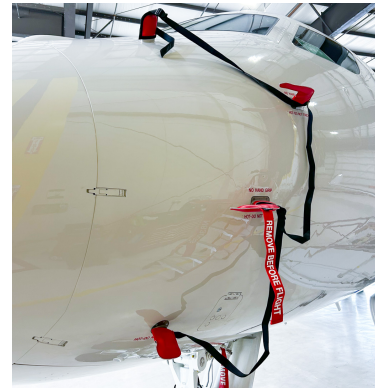
Gulfstream Aerospace Gulfstream GVII (G400,