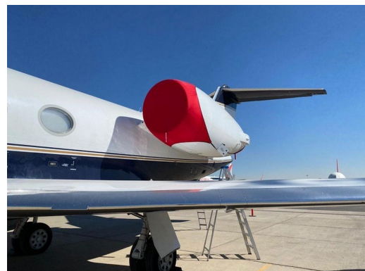
Grumman Gulfstream G-IV SP Engine Cover, bikini type