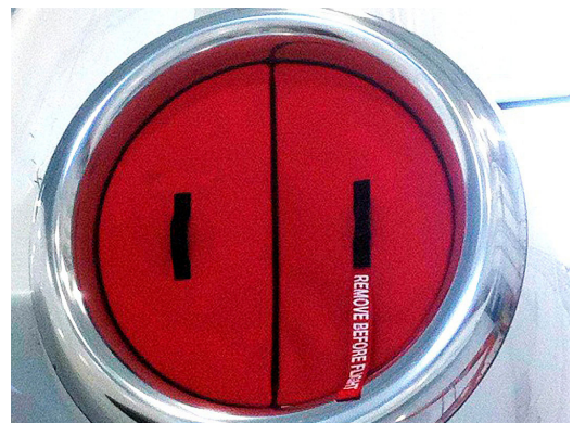
Falcon 2000EX Intake Plug