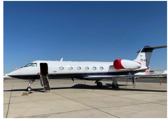
Grumman Gulfstream G-IV SP Engine Cover, bikini type