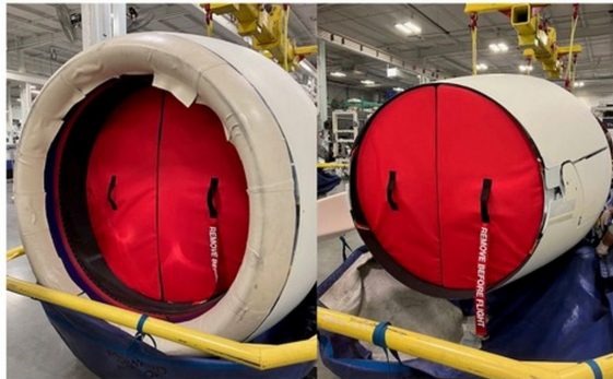
Gulfstream G500 FOD protection plugs for mfg process