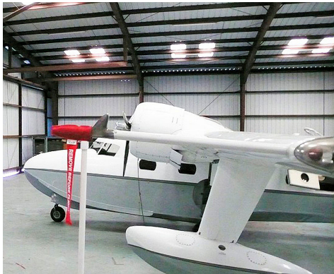
Grumman Mallard Pitot Cover with Install Tool

Canopy Covers are commonly referred to as Cabin Covers, Fuselage Covers, Canvas Covers, Canopy Caps, etc.