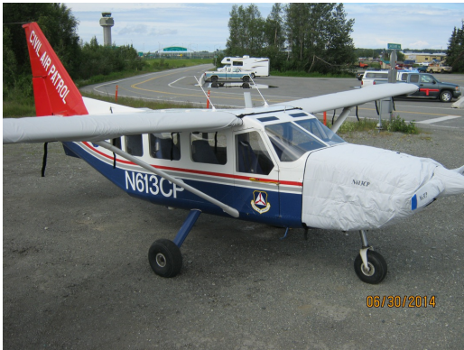
Gippsland GA-8 Airvan Insulated Engine, Wing and Prop Covers