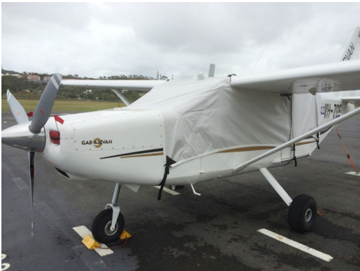
Gippsland GA-8 Airvan Canopy Cover