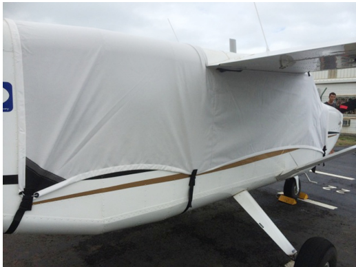
Gippsland GA-8 Airvan Canopy Cover

This cover type is made from Silver Acrylic Sunbrella canvas and is 100% lined with a soft and smooth microfiber. Bruce's Custom Covers developed this material combination especially for aircraft protection. The outer material is medium weight and treated for water resistance, UV resistance and anti-static buildup. The inner lining is a very soft and smooth microfiber to prevent scratching. The material is very reflective, and tests show that the cabin interior temperature can be reduced to near-ambient temperature on the hottest of days. It is water, ice and snow repellent, yet breathable to allow moisture to escape from between the cover and the aircraft surface.