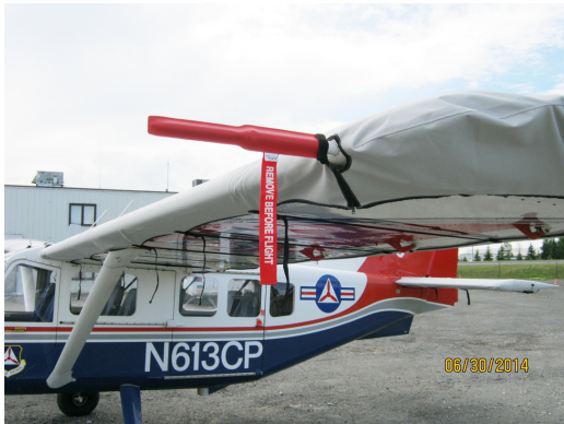
Gippsland GA-8 Airvan Wing Covers, Pitot Cover

shorter useful life if used continuously outside than the all-year use material.