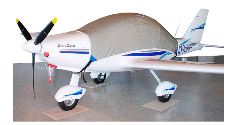
Sting Sport Canopy Cover & Engine Plugs

This cover type is made from Silver Acrylic Sunbrella canvas and is 100% lined with a soft and smooth microfiber. Bruce's Custom Covers developed this material combination especially for aircraft protection. The outer material is medium weight and treated for water resistance, UV resistance and anti-static buildup. The inner lining is a very soft and smooth microfiber to prevent scratching. The material is very reflective, and tests show that the cabin interior temperature can be reduced to near-ambient temperature on the hottest of days. It is water, ice and snow repellent, yet breathable to allow moisture to escape from between the cover and the aircraft surface.