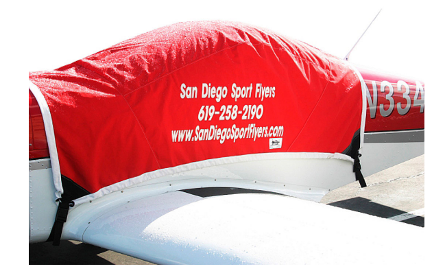
Gobosh Canopy Cover with custom Imprint