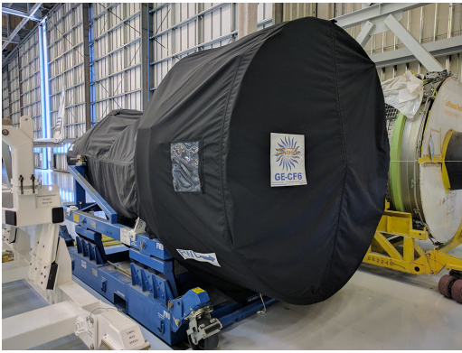
GE CF-6 Off-Link Engine Cover