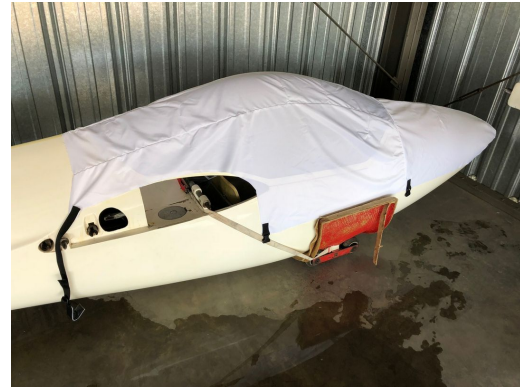
Glasflugel H-301B Libelle Canopy/Nose Cover, test fit cover