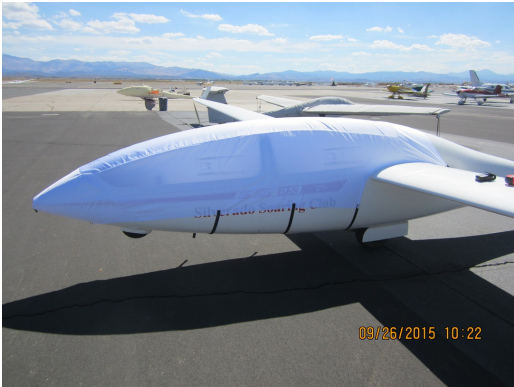
DG-505 Canopy/Nose Cover (test fit cover)

water resistance, UV resistance and anti-static buildup. The inner lining is a very soft and smooth microfiber to prevent scratching. The material is very reflective, and tests show that the cabin interior temperature can be reduced to near-ambient temperature on the hottest of days. It is water, ice and snow repellent, yet breathable to allow moisture to escape from between the cover and the aircraft surface.