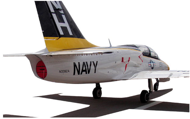
L-39 Exhaust Plug