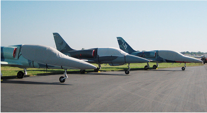
L-39 Canopy Cover, Canopy/Nose Covers, Plugs

Covers developed this material combination especially for aircraft protection. The outer material is medium weight and treated for water resistance, UV resistance and anti-static buildup. The inner lining is a very soft and smooth microfiber to prevent scratching. The material is very reflective, and tests show that the cabin interior temperature can be reduced to near-ambient temperature on the hottest of days. It is water, ice and snow repellent, yet breathable to allow moisture to escape from between the cover and the aircraft surface.