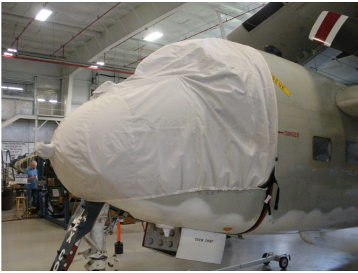
Grumman Tracker Canopy/Nose Cover