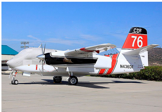
Grumman Tracker (turbine model) Canopy/Nose Cover