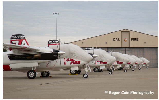
Grumman S-2 Tracker Canopy/Nose Cover