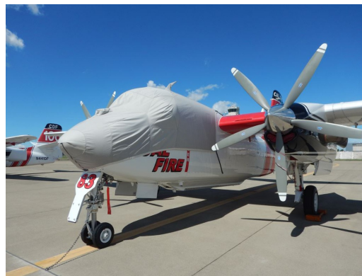
Grumman Tracker Canopy/Nose Cover