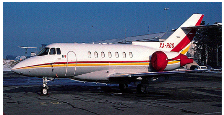
Hawker 1000 Engine Cover