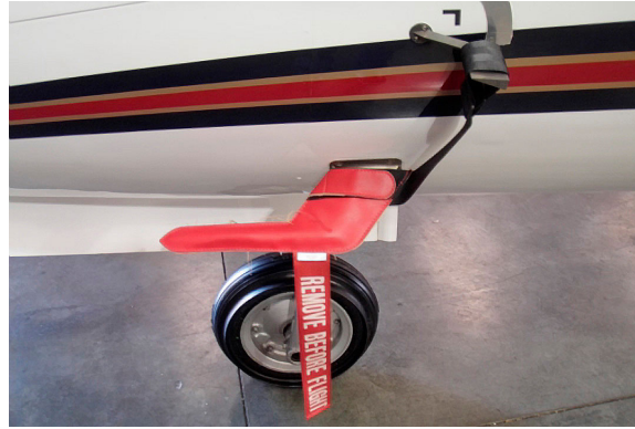
Learjet Pitot Cover and AOA Strap

Hawker Beechcraft 1000 Pitot Tube Covers, NOT HEAT RESISTANT TYPE , are made of Naugahyde vinyl, and are designed to cover the entire pitot assembly. Slipping over the tube, the cover tightens around the base with a Velcro strap detail. A "Remove Before Flight" streamer is attached to the cover. Heat Resistant Pitot Covers are an upgrade to this design, and help prevent the pitot cover from melting onto the tube if the pitot heat is accidentally turned on while installed. If you want the set tethered together, please let us know.