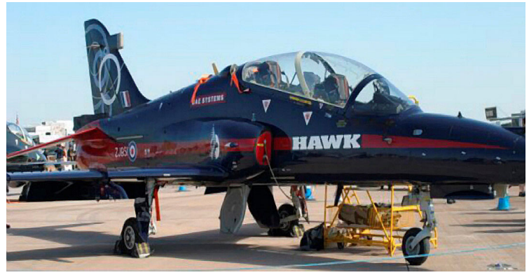
Covers, Plugs, HeatShields and related items for the British Aerospace Hawk 108