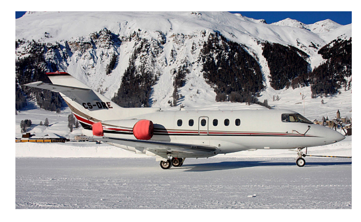
Hawker 800XP Tri-Fold Engine Intake/Exhaust Cover Set