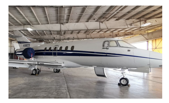
Hawker 750 HeatShields & Engine Covers

Cockpit Heatshields are interior sunshades for the aircraft's cockpit. The product is a unique composite of closed-cell foam with a silver mylar finish. The semi-rigid design is stiff enough to stand inside the window framing. The set folds up flat and is easily stored in the included storage sleeve. Some designs may require velcro and suction cups. Our Heatshields for jets are offered white side out because some aircraft manufacturers have issued advisories against reflective window inserts due to potential heat damage. A Heatshield is an excellent short-term remedy for cockpit overheating, but an external fabric cover is more effective for long-term protection.