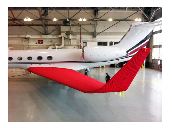
Gulfstream G550 Wing/Winglet Covers