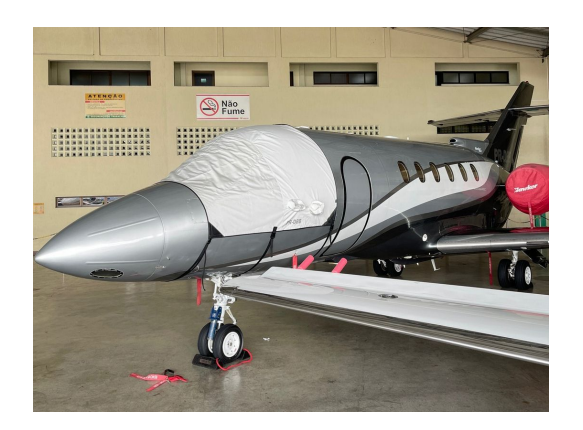
Hawker Beechcraft 750, 800, 800XP, 850XP Cockpit Cover