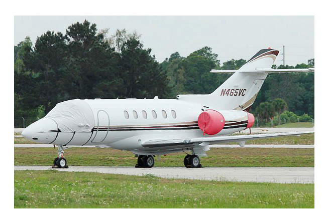
Hawker 800 Cockpit Cover and Engine Covers set