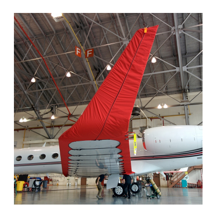
Gulfstream G550 Wing/Winglet Covers

WINTER USE MATERIAL - Made with Solution-Dyed Polyester fabric, this option is intended for seasonal use to aid in deicing, rain mitigation, or for occasional travel. The material is lighter and more compact, but more susceptible to UV damage and may have a shorter useful life if used continuously outside than the all-year use material.