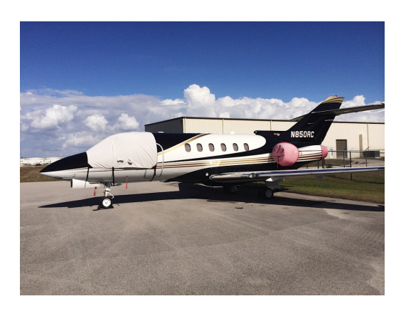
Hawker 800 Cockpit Cover, extended aft 24"