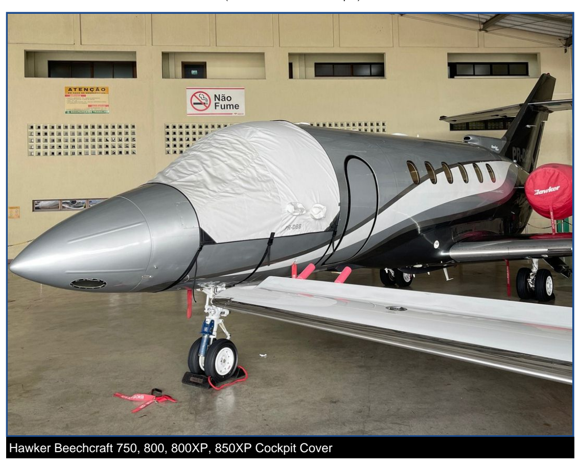
Section 1: Canopy/Cockpit/Fuselage Covers

The Hawker Beechcraft 750, 800, 800XP, 850XP Cockpit Cover helps reduce damage to the upholstery and avionics caused by excessive heat and can eliminate problems caused by leaking door and window seals. They keep the windshield and window surfaces clean and help prevent vandalism and theft.