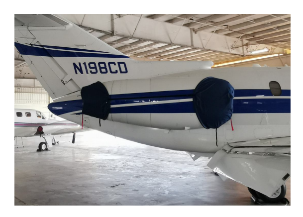
Hawker 750 Engine Covers