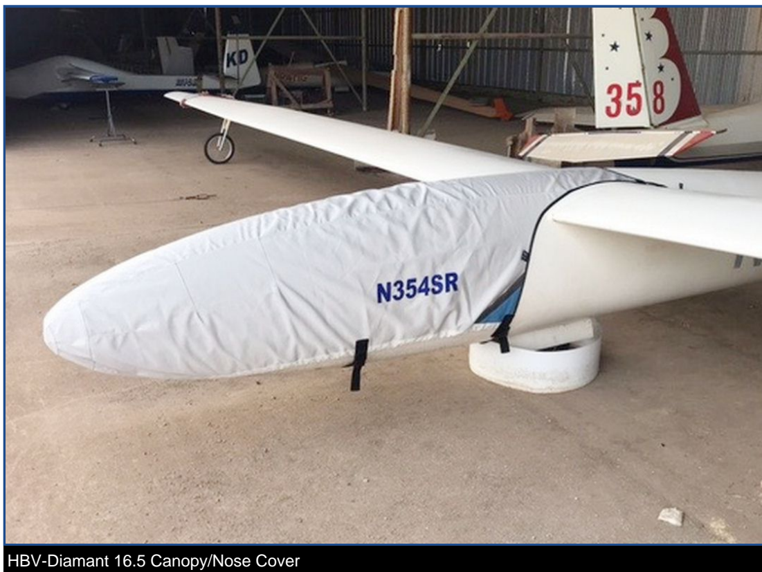
HBV-Diamant 16.5 Canopy/Nose Cover