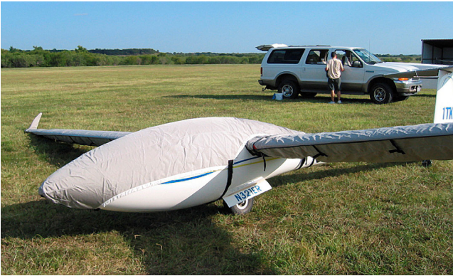
Canopy/Nose Cover, Wings and Horizontal Stab Covers