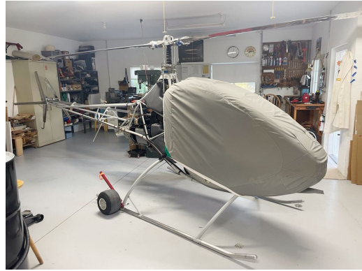
Eagle Helicycle Bubble Cover