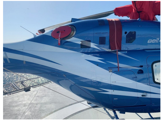
Bell 429 Exhaust Plug, Rotor Mast Cover