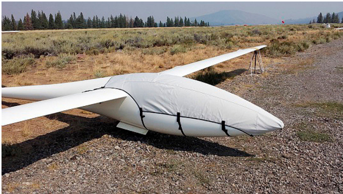
ASW-20C Canopy/Nose Cover

This cover type is made from Silver Acrylic Sunbrella canvas and is 100% lined with a soft and smooth microfiber. Bruce's Custom Covers developed this material combination especially for aircraft protection. The outer material is medium weight and treated for water resistance, UV resistance and anti-static buildup. The inner lining is a very soft and smooth microfiber to prevent scratching. The material is very reflective, and tests show that the cabin interior temperature can be reduced to near-ambient temperature on the hottest of days. It is water, ice and snow repellent, yet breathable to allow moisture to escape from between the cover and the aircraft surface.