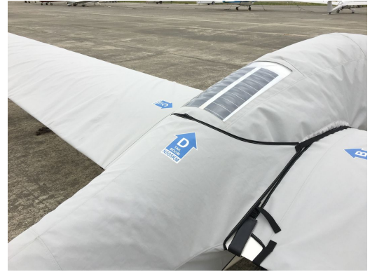
DG-505 Full Cover Set