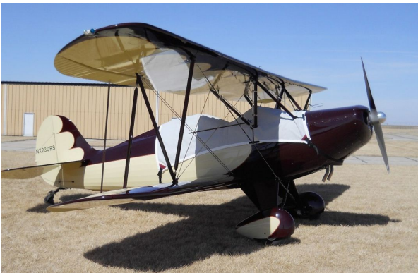
Hatz Biplane Canopy Cover

This cover type is made from Silver Acrylic Sunbrella canvas and is 100% lined with a soft and smooth microfiber. Bruce's Custom Covers developed this material combination especially for aircraft protection. The outer material is medium weight and treated for water resistance, UV resistance and anti-static buildup. The inner lining is a very soft and smooth microfiber to prevent scratching. The material is very reflective, and tests show that the cabin interior temperature can be reduced to near-ambient temperature on the hottest of days. It is water, ice and snow repellent, yet breathable to allow moisture to escape from between the cover and the aircraft surface.