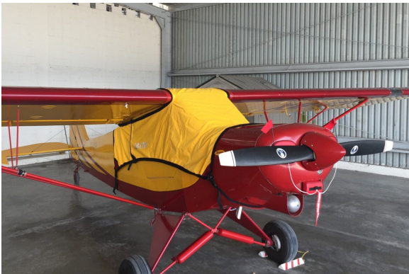
Piper Super Cub Canopy Cover, Engine Plugs

Engine Inlet Plugs are custom fit for your Hatz Biplane CB-1 intakes, made with heavy-duty vinyl material, and stuffed with a single block of sculpted urethane foam. Each plug has a zipper that allows the foam to be removed and dried if necessary. Engine plugs have warning flags that are visible from the cockpit or 'remove before flight' streamers sewn onto the face of the plugs. Most plugs are imprinted with the aircraft registration number in black for an extra charge. Storage bag NOT included. Engine plugs may be inserted after flight when the engine is still warm. Engine Inlet Plugs are commonly referred to as Cowl Plugs, Intake Plugs, Cowl Blocks, Engine Blocks, and Engine Bungs.