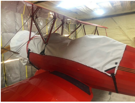
Hatz Biplane CB-1 Canopy Cover & Engine Cover