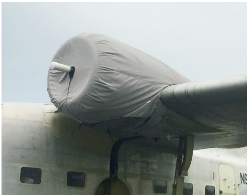
Grumman Albatross Engine Covers

This cover type is made from Silver Acrylic Sunbrella canvas and is 100% lined with a soft and smooth microfiber. Bruce's Custom Covers developed this material combination especially for aircraft protection. The outer material is medium weight and treated for water resistance, UV resistance and anti-static buildup. The inner lining is a very soft and smooth microfiber to prevent scratching. The material is very reflective, and tests show that the cabin interior temperature can be reduced to near-ambient temperature on the hottest of days. It is water, ice and snow repellent, yet breathable to allow moisture to escape from between the cover and the aircraft surface.