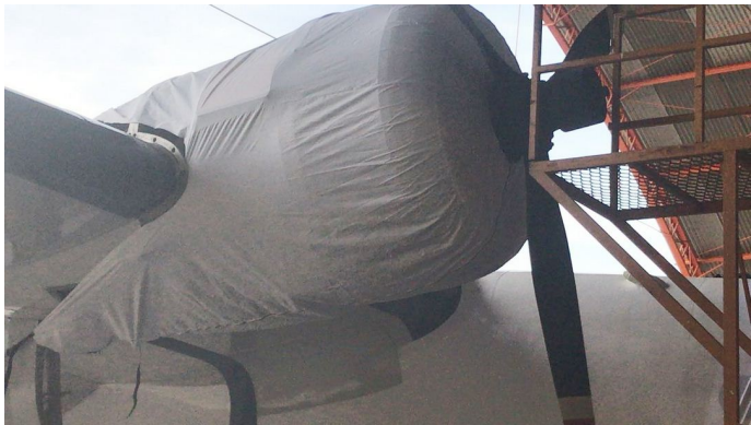
Grumman HU-16 Albatross Engine Cover (test fit cover)