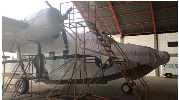
Grumman HU-16 Albatross Cockpit/Nose Cover and Engine Cover(test fit covers)