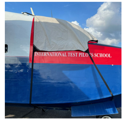
Grumman Albatross Cockpit Cover