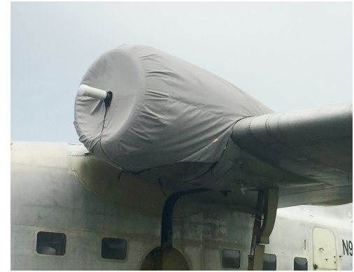
Grumman Albatross Engine Covers