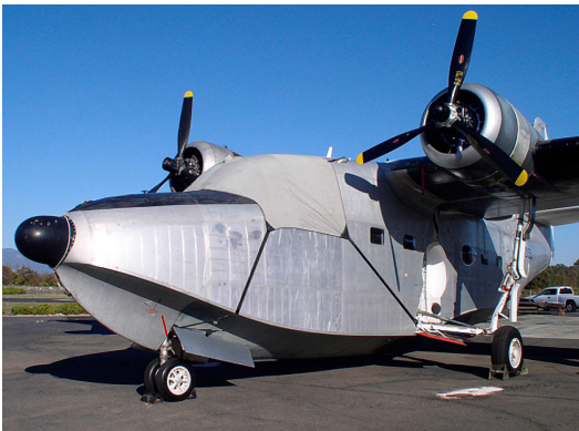
Canopy Cover for the Grumman HU-16 Albatross