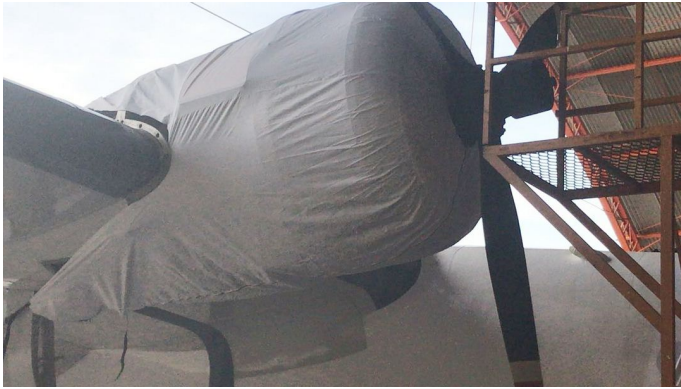
Grumman HU-16 Albatross Engine Cover (test fit cover)

This cover type is made from Silver Acrylic Sunbrella canvas and is 100% lined with a soft and smooth microfiber. Bruce's Custom Covers developed this material combination especially for aircraft protection. The outer material is medium weight and treated for water resistance, UV resistance and anti-static buildup. The inner lining is a very soft and smooth microfiber to prevent scratching. The material is very reflective, and tests show that the cabin interior temperature can be reduced to near-ambient temperature on the hottest of days. It is water, ice and snow repellent, yet breathable to allow moisture to escape from between the cover and the aircraft surface.