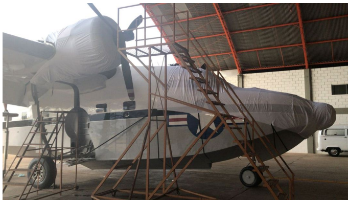
Grumman HU-16 Albatross Cockpit/Nose Cover and Engine Cover(test fit covers)

This cover type is made from Silver Acrylic Sunbrella canvas and is 100% lined with a soft and smooth microfiber. Bruce's Custom Covers developed this material combination especially for aircraft protection. The outer material is medium weight and treated for water resistance, UV resistance and anti-static buildup. The inner lining is a very soft and smooth microfiber to prevent scratching. The material is very reflective, and tests show that the cabin interior temperature can be reduced to near-ambient temperature on the hottest of days. It is water, ice and snow repellent, yet breathable to allow moisture to escape from between the cover and the aircraft surface.