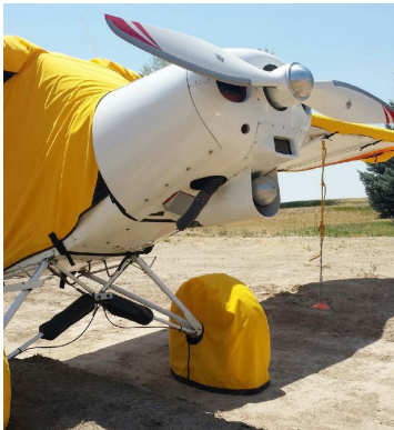
Piper PA-18 Super Cub Extended Canopy Cover, Wing & Tire Covers

WINTER USE MATERIAL - Made with Solution-Dyed Polyester fabric, this option is intended for seasonal use to aid in deicing, rain mitigation, or for occasional travel. The material is lighter and more compact, but more susceptible to UV damage and may have a shorter useful life if used continuously outside than the all-year use material.