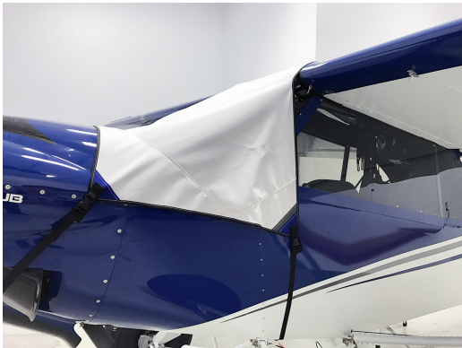
Cub Crafters CC-11 Windshield Cover

This cover type is made from Silver Acrylic Sunbrella canvas and is 100% lined with a soft and smooth microfiber. Bruce's Custom Covers developed this material combination especially for aircraft protection. The outer material is medium weight and treated for water resistance, UV resistance and anti-static buildup. The inner lining is a very soft and smooth microfiber to prevent scratching. The material is very reflective, and tests show that the cabin interior temperature can be reduced to near-ambient temperature on the hottest of days. It is water, ice and snow repellent, yet breathable to allow moisture to escape from between the cover and the aircraft surface.