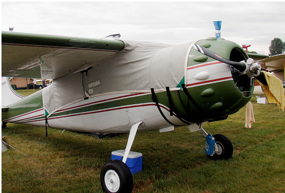
Cessna 195 Canopy Cover, extended forward and over gas caps