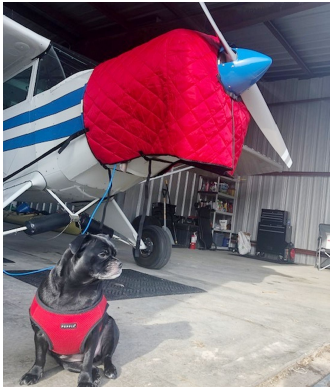
Piper PA-12 Insulated Hangar Blanket

This cover type is made from Silver Acrylic Sunbrella canvas and is 100% lined with a soft and smooth microfiber. Bruce's Custom Covers developed this material combination especially for aircraft protection. The outer material is medium weight and treated for water resistance, UV resistance and anti-static buildup. The inner lining is a very soft and smooth microfiber to prevent scratching. The material is very reflective, and tests show that the cabin interior temperature can be reduced to near-ambient temperature on the hottest of days. It is water, ice and snow repellent, yet breathable to allow moisture to escape from between the cover and the aircraft surface.