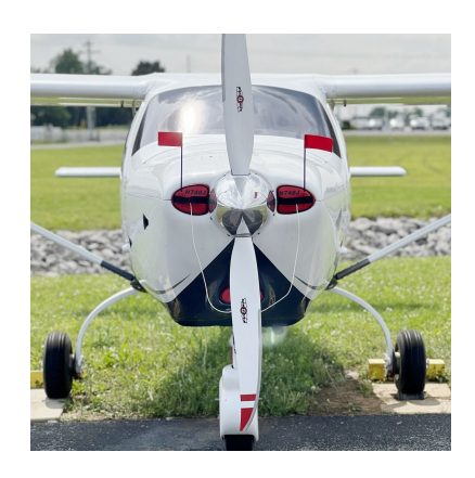
Jabiru J230-SP Engine Inlet Plugs