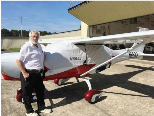
Jabiru 230SP Canopy Cover, Over-Top Style