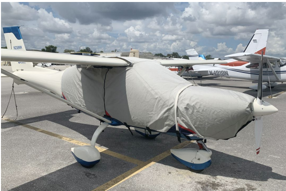
Jabiru 230D Extended Canopy Cover & Engine Covers