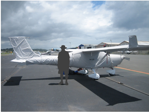
Jabiru J430 Complete Cover Set

Designed to prevent damage to the aircraft extremities in crowded hangars, these products are made of bright red Naugahyde and thickly padded with a sandwich of closed cell foam.