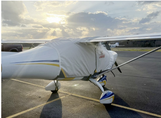
Jabiru J230-SP Extended Canopy Cover

This cover type is made from Silver Acrylic Sunbrella canvas and is 100% lined with a soft and smooth microfiber. Bruce's Custom Covers developed this material combination especially for aircraft protection. The outer material is medium weight and treated for water resistance, UV resistance and anti-static buildup. The inner lining is a very soft and smooth microfiber to prevent scratching. The material is very reflective, and tests show that the cabin interior temperature can be reduced to near-ambient temperature on the hottest of days. It is water, ice and snow repellent, yet breathable to allow moisture to escape from between the cover and the aircraft surface.