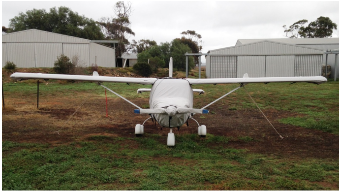
Jabiru 160 Canopy, Engine, Prop, Wings & Empennage Covers