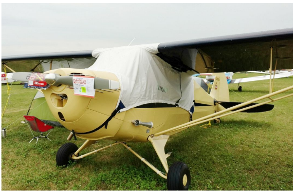
Piper J-4 Cub Coupe Canopy Cover (Over-Top)