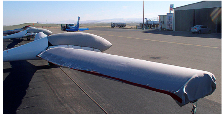
Sailplane Full Cover Set Graphic Indicators (Discus 2B, 3D model)