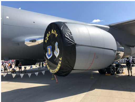
Boeing KC-46 Intake Cover