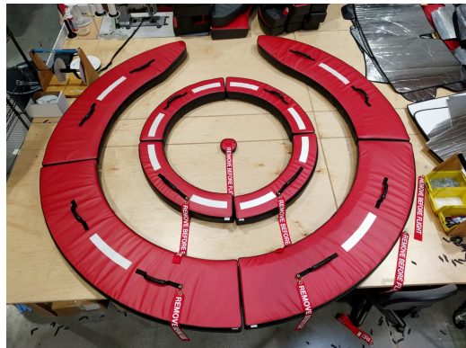
Boeing 747-8 Exhaust Plugs

The Engine Inlet Plugs are custom fit for your Boeing KC-46, KC-46A, Pegasus intakes, made with heavy-duty vinyl material, and stuffed with a single block of sculpted urethane foam. Each plug has a zipper that allows the foam to be removed and dried if necessary. Engine plugs have 'remove before flight' streamers sewn onto the face of the plugs. Most plugs are imprinted with the aircraft registration number in black for an extra charge. Storage bag NOT included. Engine plugs may be inserted after flight when the engine is still warm. Engine Inlet Plugs are commonly referred to as Cowl Plugs, Intake Plugs, Cowl Blocks, Engine Blocks, and Engine Bunges.