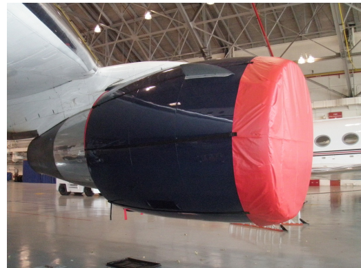
Boeing 767 Intake Covers Ship Set