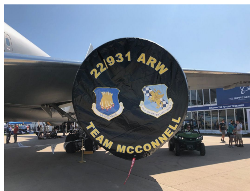
Boeing KC-46 Intake Cover